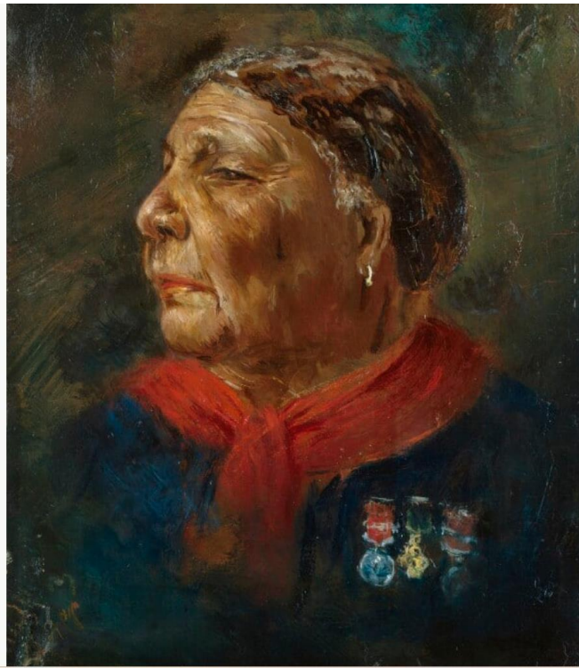
Mary Seacole, by Albert Charles Challen, 1869

https://www.npg.org.uk/blog/black-cultural-archives-looking-to-the-collection-this-black-history-month?quip_start=10&quip_limit=10#quip-topofcomments-qcom